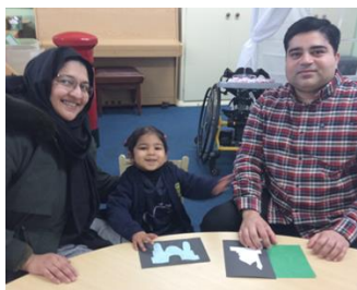
Ramadan celebrations in Merton Class

Over the past week, as a school we have been learning about the month of Ramadan. The children have really enjoyed taking part in art activities and learning more about Ramadan.